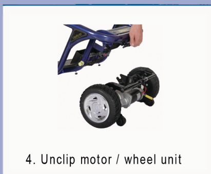
4. Unclip motor / wheel unit