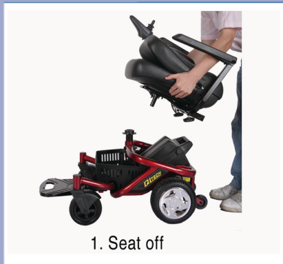
1. Seat off