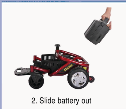
2. Slide battery out