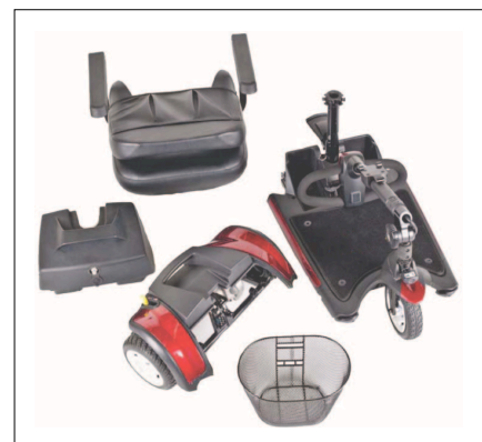
Figure 9: Buzz 3 collapsed.