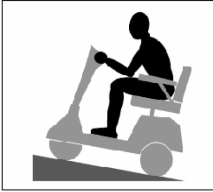
Figure 1. *Maximum slope 8°