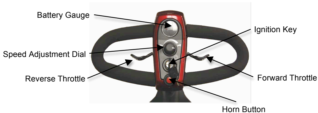
Figure 3. Dashboard