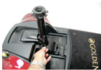
Figure 4. Seat Pin